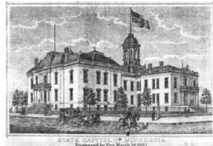
The old State Capitol, where the Law Library was located.

Annual Reports, her budget concerns resonate with today's worries about insufficient funding for libraries. Specifically in the 1866 Annual Report, she requested additional appropriations for the State Library's contingency fund which she intended to use "for the preparation and printing of a new catalog, the binding of old state newspapers which the State Library receives free of charge, and for the acquisition of individual volumes to complete sets of judicial reports received from most of the States."